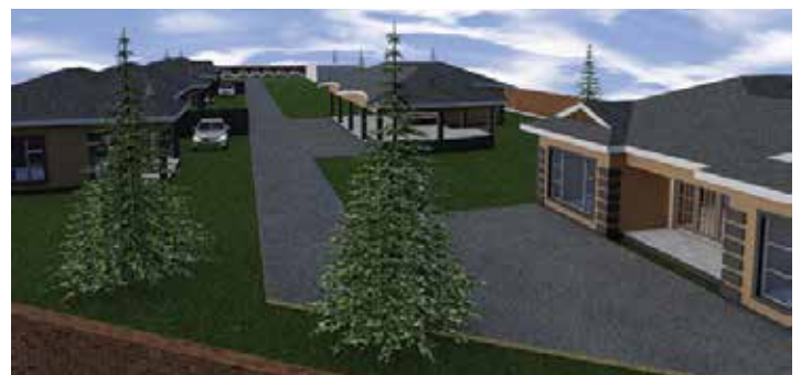
Looking Ahead: Pictorial plan of the IYWD's office space and centre under construction in Bindura

progress in all aspects of our advocacy work, the feminist movement we belong to created and continues to create an oasis of hope for every woman. As you go through the work the IYWD conducted in the last year, it is important to note that this report is not exhaustive as it focuses on the major highlights of an eventful year. The ripple effect of the impact of our work continues to be felt in the communities. This report documents the hard work we are putting into achieving #WHATWOMENWANT and every young woman getting #HERRIGHTOFWAY. Above all, it is a powerful reflection of the agility and resilience of the young women and women in the communities. As the organisation continues to evolve, we are excited to share with you our brand transformation as the IYWD revamped its look by introducing a new logo. Our new logo symbolizes the agility and youthfulness of the organisation. It embodies our feminist roots and energy. In the same vein we also gave a face-lift to our website to enable us to connect with young women we work with, our partners, allies and friends from all over the world more easily. As we step into 2022, we continue to work towards realising our dream for a safe, secure, sustainable and conducive working environment for our membership, secretariat and stakeholders. I am positive that we will be welcoming you all to our new office space and centre which is under construction.